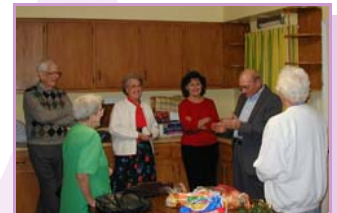
Volunteers are people like you!

When you arrive at TSBC everything you need to complete your project will be ready. We also promise that you and the service you provide will always be appreciated. It is through the servitude of people like you that TSBC will continue to grow in its ministry outreach to the surrounding Tri-State area.