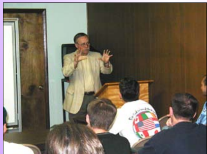
Volunteers make the difference!