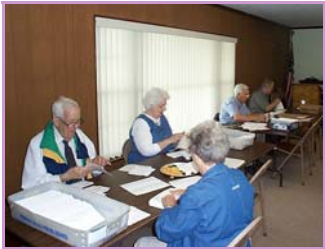
Sending out a newsletter

The purpose of the TSBC Volunteer Program is to promote and develop the ministry of Tri-State Bible College. By involving Christians who have the hearts of servants, the college will strengthen its outreach in the Tri-State area.