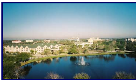
View from the Orlando Airport Marriott Hotel