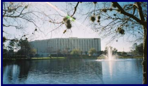
The Orlando Airport Marriott Hotel