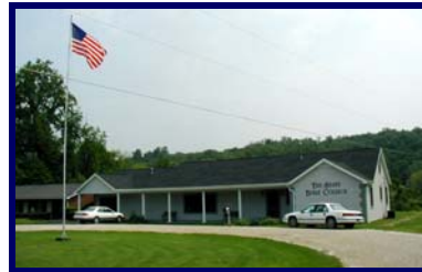
Tri-State Bible College Now ACCREDITED

Several years ago, I was not able to attend the annual meeting of the Accrediting Association of Bible Colleges (AABC) because I was at the VA Cleveland Clinic having by-pass surgery. As I was wheeled into the surgical area, I fully recognized that the Lord could take me home, or He could bring me through surgery and con-